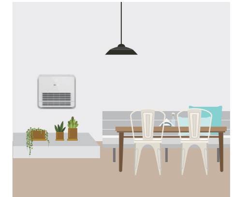
Hanging on the wall