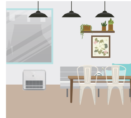
Standing on the floor

The unit can be placed on the floor or hung on the wall, and offers flexibility with surface-mounted, embedded, or concealed installation options.